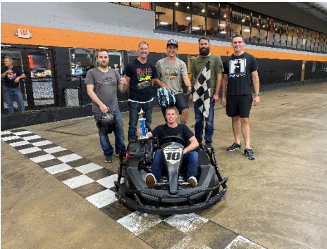
LaMettry's Collision took 1 st place in Thursday night's race