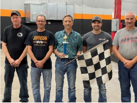
Tuesday night's winning team from Wenzel Auto Electric, Mankato